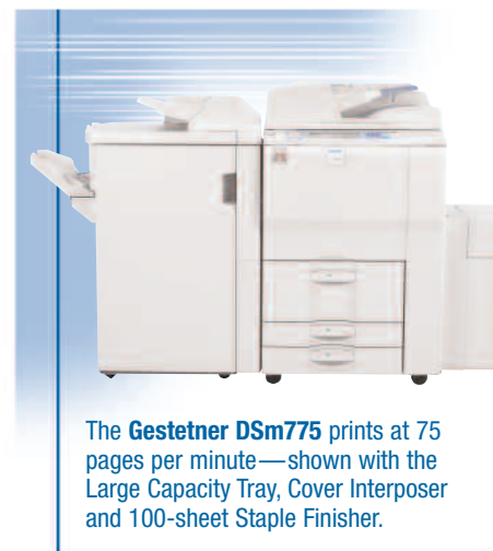
The Gestetner DSm775 prints at 75 pages per minute—shown with the Large Capacity Tray, Cover Interposer and 100-sheet Staple Finisher.