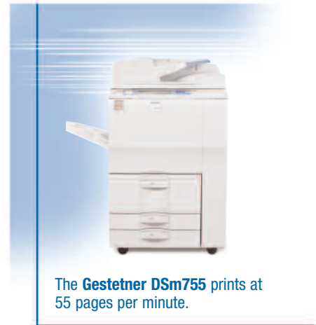
The Gestetner DSm755 prints at 55 pages per minute.